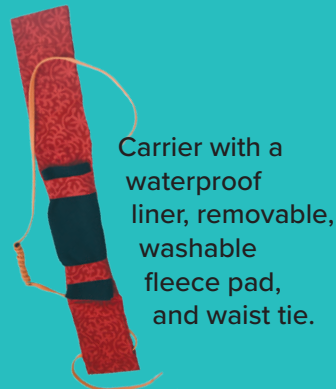
Carrier with a waterproof liner, removable, washable fleece pad, and waist tie.