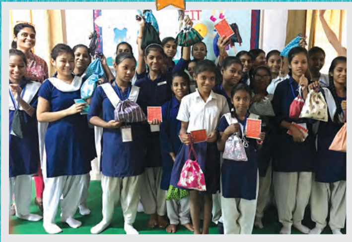
Nai Disha School