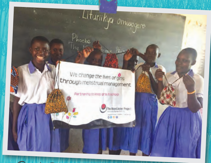
Bunake Primary School

ALL of the girls received our reproductive health curriculum.