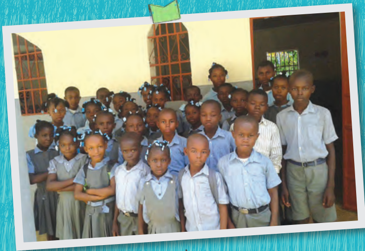
Bay Road Church School